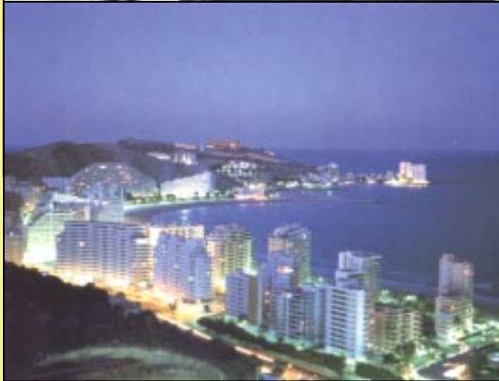
BAHÍA DE LOS NARANJOS (PLAYA DEL RACÓ)